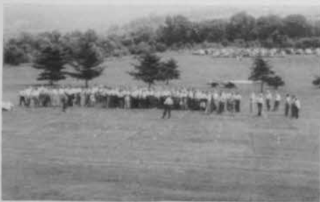
Group attending Phila. Turf Field Day study disease control plots at Spring Mill Course, Phila. CC where Marshall Farnham is supt.

grow turf, whether on golf course, home lawn, athletic field, park or cemetery. A three unit Aerifier gang equipped with new \frac{3}{4} " diameter spoons was given a thorough trial at the Spring Mill course and the power model Aerifier had been used on four