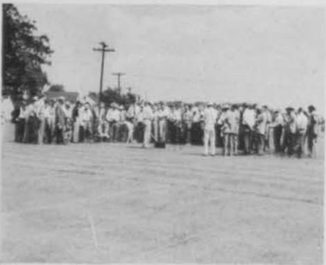
Fifteen different strains of bent grass are shown group interested in turf management at Rutgers Univ. during New Jersey Field Day.

greens. The consensus this season was to loosen the soil to get stronger roots and the West Point Lawn Products' Aerifiers do the job well.