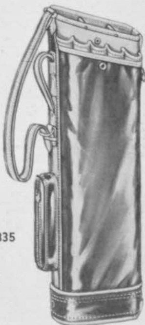
Model L-835 Original Pax Bag $25 retail