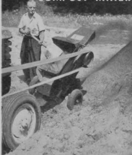
Royer Model M-2 (up to 8 cu. yds. per hour) at York Downs Golf Club, Toronto, Canada.

Qualify your greens for championship play by feeding them with Royer-ated top dressing. All material processed in a Royer machine are thoroughly mixed and shredded to pea-size granules or smaller, and delivered free of small stones, twigs and trash . . . ready for direct application to greens at any season of the year. Very inexpensive to operate. Two or three men can prepare four to eight times as much top dressing in a Royer as is possible by hand methods. Hundreds are now in use on the country's best known courses. Many models to choose from. Bulletin 46 gives full information. Write for it today . . . and also ask about the Royer method of shredding stolons.