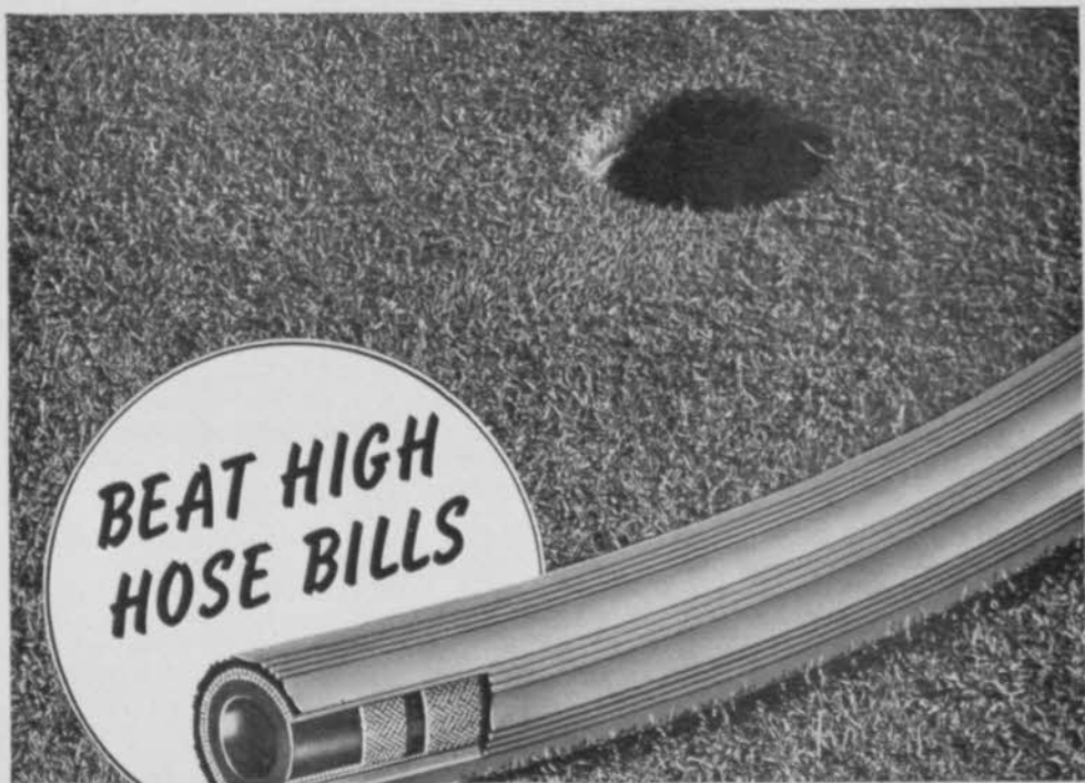
Emerald Cord, Wingfoot—T.M.'s The Goodyear Tire & Rubber Company, Akron, O.