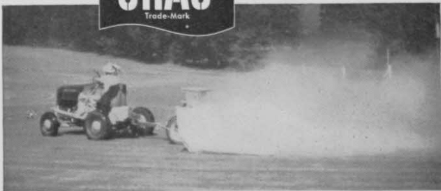
Experimental fairway dusting at Merion Golf Club, Ardmore, Pa.

• Start your CRAG Turf Fungicide schedule now to keep greens and fairways free from dollar spot this season. Regular applications of CRAG Fungicide to turf will give you effective protection against dollar spot. These applications will also prevent both pink patch and green scum .