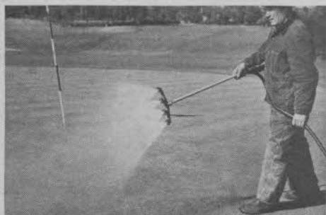
TERSAN, SEMESAN, and Special SEMESAN are registered trademarks of E. I. du Pont de Nemours & Co., (Inc.)