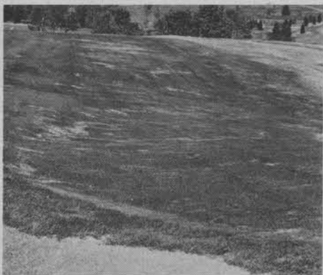
White grub damage on a fairway caused by the Phyllophaga grub. Weeds and clover get a start in the injured spots. It costs less to prevent, rather than repair, damage.

Both kinds of nitrogen have their place in turf fertilizer programs, but the trend is toward organics for fairways. Some use organics only, others a combination of both, and a few prefer chemical sources only. Split applications are necessary with soluble fertilizer on starved turf to provide enough nitrogen. Serious burning of the grass is bound to occur when the total quantity is applied at one time. True organics are safe to use in a single appli-