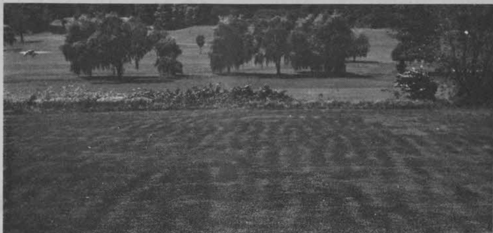
Corrugations in a watered fairway caused by excessive mowing speed. Crabgrass and clover become bad in the depressions. Tractor speed should be reduced and fairways should be cross mowed every other time to correct the conditions.

50 and 100 pounds, respectively are equivalent to 1 and 2 tons per acre.