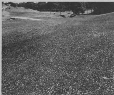
Weeds are mostly plantain and grass is Kentucky bluegrass with a little bent. Good turf can be secured by using 2, 4-D and fertilizer.

Nitrogen is the key to good fairway turf: On established fairways, nitrogen fertilization is the thing that causes grass to spread and form a dense turf. When used in adequate amount, it helps discourage clover and weeds. There were good fairways before the days of sodium arsenite and 2,4-D, both in the North and