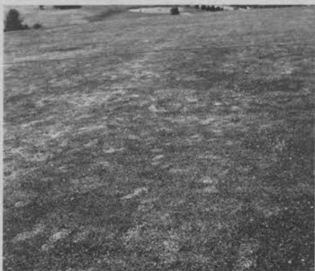
A watered fairway of poa annua. The Kentucky bluegrass is gone because of close cutting and heavy watering. The footprints are bad because grass is wilting and about to die. Then clover will become worse. Renovation and reseeding with colonial bent is needed on this course.

Kind of Nitrogen Fertilizer to Use: There are two types of nitrogenous fertilizer. One kind is water soluble and exemplified by ammonium sulphate, urea, ammonium nitrate, cyanamid, etc. They