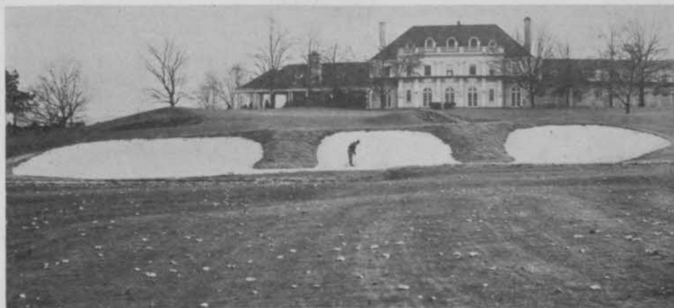
Eighteenth fairway of the Fresh Meadow Course showing larger fairway traps and reconstructed brook (in front of bunkers) with player trying to reach green in rear of clubhouse.

It was a logical step when Fresh Meadow, after yielding its championship course, one