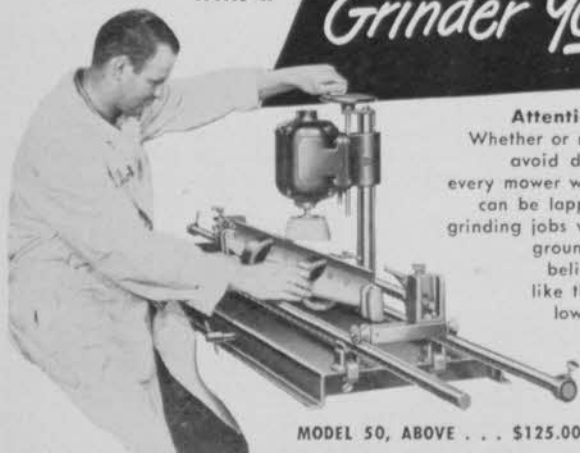
MODEL 50, ABOVE . . . $125.00 F.O.B. Plymouth, Ohio

Attention Golf Clubs, Parks, Cemeteries! Whether or not you do your own grinding, you can avoid delays and increase the service life of every mower with the Model 50 Bench Grinder. Reels can be lapped in several times between complete grinding jobs when the bed knives are kept properly ground on the Model 50. The price? Hard to believe . . . but true! Never has a machine like the Model 50 come anywhere near this low cost. Perfect companion to the famous PEERLESS MOWER SHARPENER. Write today for descriptive bulletin.