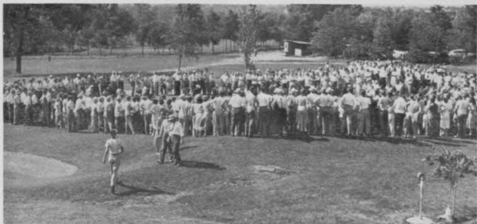
Gene Littler draws Lincoln's biggest gallery for a golf event during final tournament round of the USJCC National Junior Amateur Championship at Country Club of Lincoln (Nebr.). 168 boys from 35 states teed off for the qualifying round by virtue of having won in local and state Jaycee sponsored tournaments from a field of more than 8,000 junior linksmen.

these tees are very hard to keep grass on during the usual summer dry spells. To make matters worse, chipmunks and mice burrow down and make their nests in the hollows in the stone. We eliminated the mice with a 20% AWTU powder. Developed by the government during the war, it's mighty potent stuff on the short tail mice we have. I haven't tried it on the chipmunks as yet, but I have every reason to expect the same results on them.