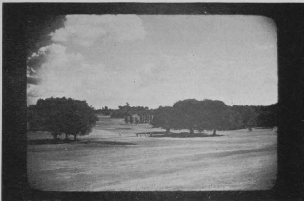
Fourteenth fairway of the beautiful Brookfield CC (Buffalo, N. Y.) scene of the 45th Western Open Championship, July 29 to August 1.