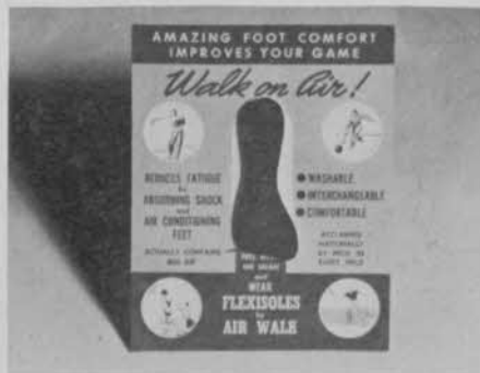
Counter display card for Flexisoles.

Air Walk Cushion Insoles is the trade name of a new featherweight rubber foam construction insole designed to fit any size shoe. Thousands of minute air-holes combined with top-to-bottom perforations forces air around the foot and toes to give