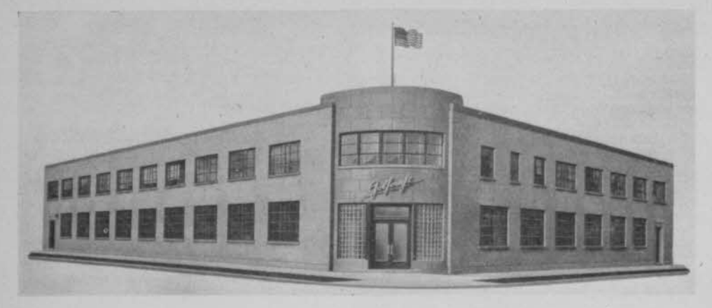
Golfcraft's new and modern plant is at 1700 West Hubbard St., conveniently located near downtown Chicago.

NEW SLINGERLAND GOLF-GLOV — Jack Redmond, internationally famous trick shot golf artist demonstrates a Slingerland GOLF-GLOV, custom manufactured from fine, durable glove leather that will not harden or lose shape when soaked with perspiration or water. It consists of an open, two-fingered sleeve to occommodate