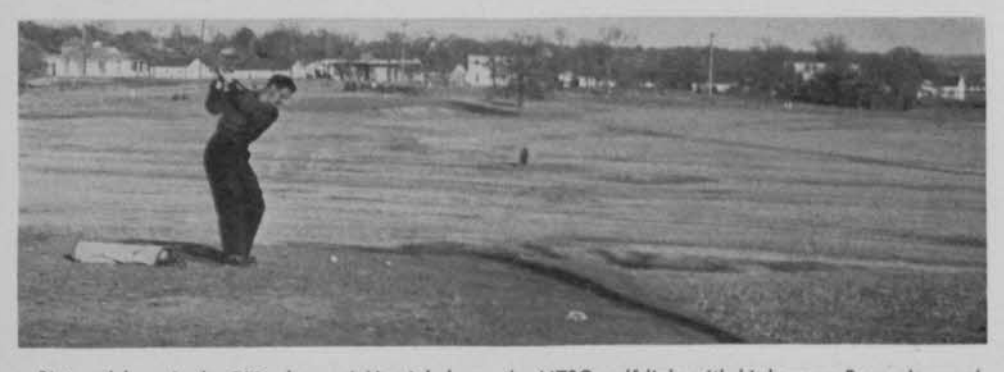
Pictured here is the 300-yd. par 4 No. 1 hole on the NTSC golf links with high-mown Bermuda rough area to the right.