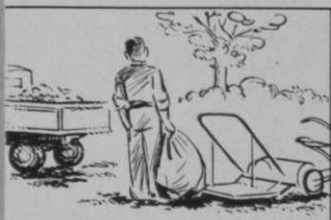
Hopper is easily removed from sweeper for quick disposal.