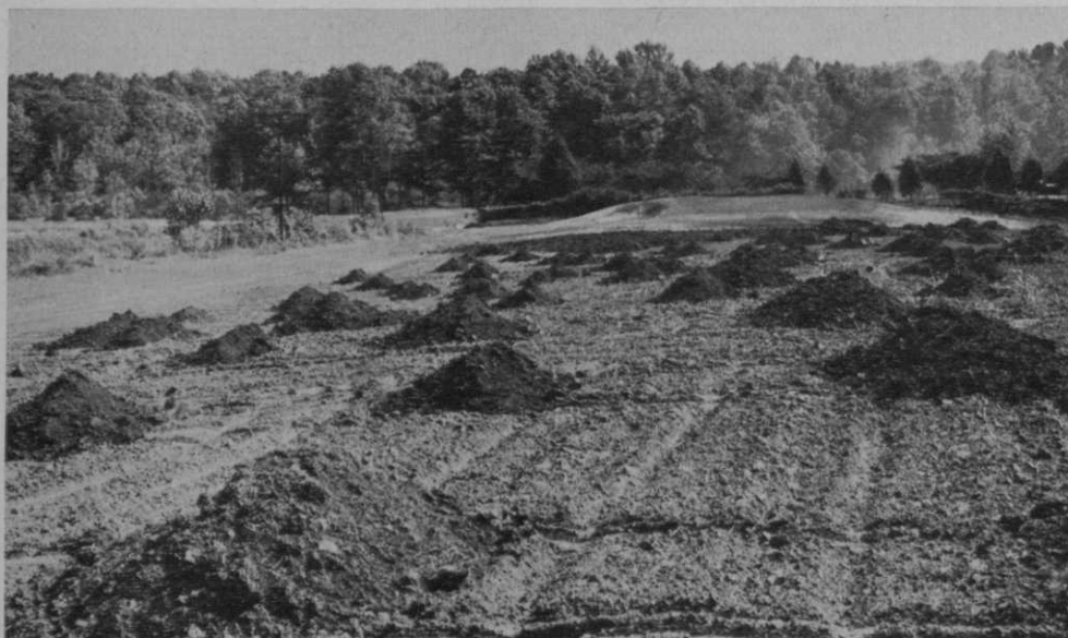
Fertilizer is dumped on the fairway of the third hole of the new Williamsburg Inn Golf course preparatory to being spread. The fertilizer had to be used fairly heavily on some of the open fields where the topsoil had washed. In the background can be seen the bunkers and green of the third hole.