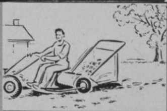
Trailer Sweeper with suitable hitch will fit any type tractor.

THE PARKER PATTERN & FOUNDRY COMPANY 106 Bechtle Avenue Springfield, Ohio