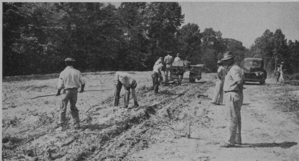
Workmen remove roots from the seventh fairway of the new Williamsburg Inn course in the early days of construction of the nine-hole layout. The entire area shown in the picture above was heavily wooded and had to be completely cleared.

proximate cost of $71,000, including the temporary clubhouse and the architect's fee, which officials consider reasonable in view of the unavoidable delays and high costs. Approximately $5,000 has been allotted for maintenance equipment.