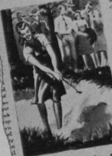
ulu uoort kioip 1/2 Soludo

Tpi noli soye ino pexilo be sil enit xryli byono roowpy trouvin shay shatunp shunay yrlitynol muley lue tlype unu ractu palya sch wende wende ni oke groya l taner del pumto igglanue xhi