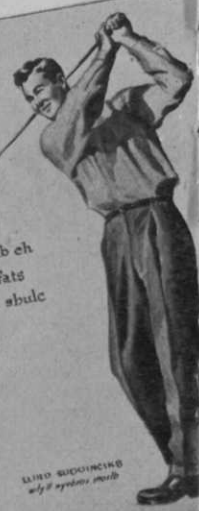
LIRO SUPONICHO ulyll wylton mado

Aory ntno slyon dech peri cl tos Inb lytrni scirema lledog kool ti Elthl oens ot mih gnoleb ew era kaew tub eh Si gnorts rof ruey meardeb. nwohs dna ffats Sdlrow gnidael wreflog refferp rogercom shulc