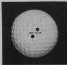
THE SPALDING TOP-FLITE The super-tough ball... built to take a beating.