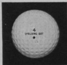
THE SPALDING DOT —golf's greatest ball . . . choice of the champions!

It's an "X" that means "Xtra" sales — the new "X-clusive" Spalding gift wrap for Spalding golf balls! In eye-catching colors of green and red, these specially wrapped boxes of a dozen make the ideal Christmas gift for your members. Put them on display early . . . boost your Christmas volume with Spalding.