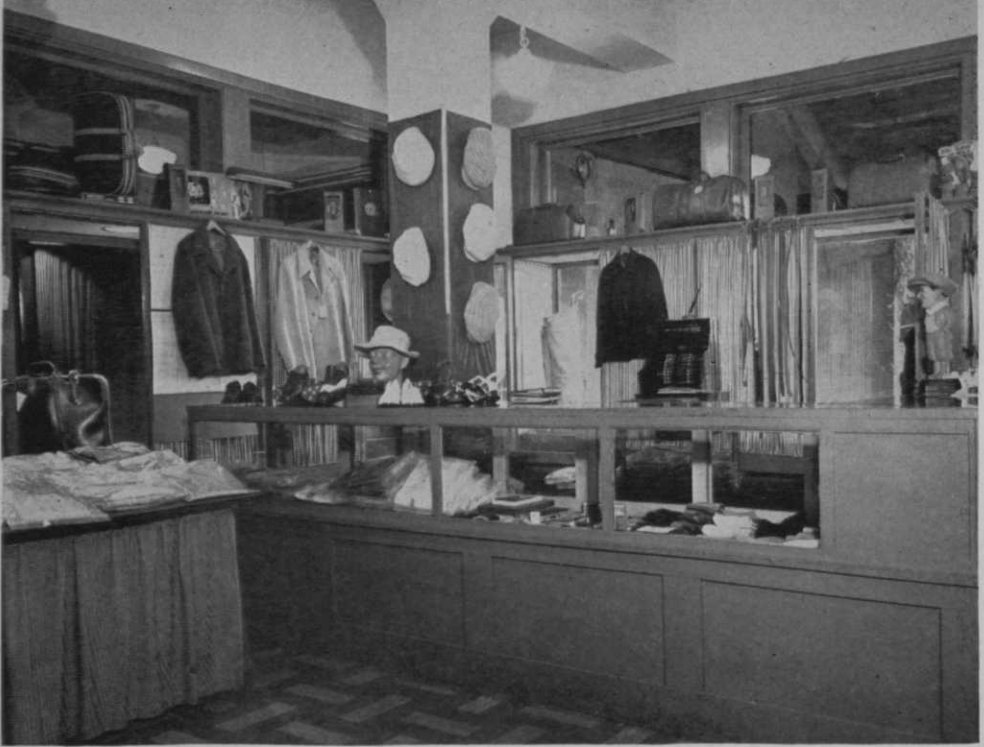
A few small specialties are in the showcase at the Olympia Fields shop, otherwise the stock is displayed where it invites handling by prospective customers. They see plenty that they want.

and forceful advertising that seldom is beaten by the advertising departments of large stores.