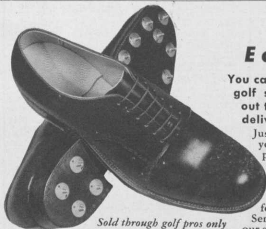
Sold through golf pros only

"My experience has proved to me that if the swing is not properly formed in the first few months it is a long and hard task to try to make changes at a later date.