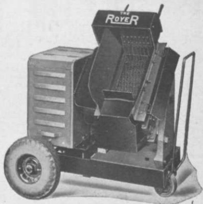
Royer Model "H"

A model for every golf course—gasoline engine, belt-to-tractor or motor driven. Prompt deliveries.