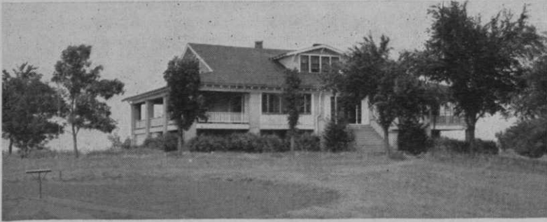
There's always something doing at the Abilene CC.

Abilene, Kan., has a population of slightly more than 6,000 according to the 1940 census. You're read of Abilene, but you may have forgotten why you happened to see its name. It's the home town of Gen. Eisenhower. The town has another distinction as far as golfers in Kansas are concerned. It's also the home of one of the liveliest and most attractive small-town country clubs in the United States.