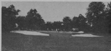
5th green at Indian Hill; first green in midwest to be planted vegetatively to creeping bent stolons.