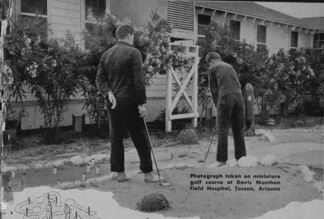
Photograph taken on miniature golf course at Davis Monthan Field Hospital, Tucson, Arizona