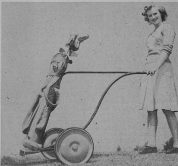
Figure your potential earnings ... if 40% of your players (club averages vary from 25% to 75%) were to rent Kangaroo Kaddies from you at 25 to 35 cents per round. Why not place a trial order now , and prove it. Or, if you already know the cart rental demand for your club, write for terms on a large purchase of Kangaroo Kaddies.

KANGAROO KADDY FEATURES: double-ball-bearing wheels, wide-spread for balance on hillsides. Lightweight, fingertip balance. Built of chrome molybdenum steel tubing, electrically welded. 12-inch wheels. Wide rubber tires will not cut greens.