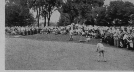
Left: Tam O'Shanter, within Chicago City limits, had its parking lots taxed to capacity. Right: Although Tam's crowds are big, the galleries get a good break due to the fine work of the Marshalls.

has continually improved the course both scenically and as a test of golf. On new trees and shrubs alone (more than 2,000) he has spent more than $35,000.