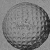
FLYER (Pro only)