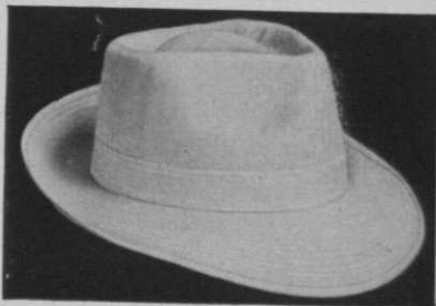
KING CONGO . . . . . NO. 2975

Smartly tailored in top quality, light weight, water repellent material. Steam blocked, flexible, multi-stitched brim; made in light tan only. Sizes, 6 \frac{7}{8} to 7 \frac{1}{2} .....Retail $1.75