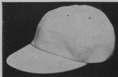
FOREST HILLS . . . . . NO. 395

The new 1944 model in white duck, with airy, side ventilators, multi-stitched brim, crown band and transparent, green acetate eyeshade in front brim. Small, medium, large and extra large sizes.....Retail 75c