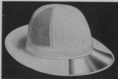
CONGO . . . . . NO. 2325

Smartly tailored in top quality, light weight, water repellent material. Steam blocked, flexible, multi-stitched brim; made in light tan only. Sizes, 6 \frac{7}{8} to 7 \frac{1}{2} .....Retail $1.75