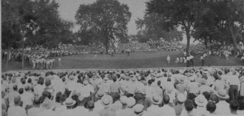
Last year, 30,000 galleryites packed the Tam O'Shanter course on the final tourney day.