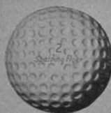
FLYER (Pro only)