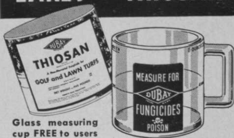
Glass measuring cup FREE to users

Turf correctly treated with Du Bay's new fungicide, "THIOSAN", is uninjured by treatment, usually shows better color, benefits by more prolonged protection because "THIOSAN" is insoluble in water—though it disperses quickly for sprayer application. Order from your supply house. Du Bay fungicide measuring cup, illustrated, free with your order while supply lasts. Level-full, holds about 5 oz. of "THIOSAN."