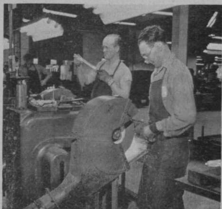
Workmen grind the final edge on bayonets at the American Fork plant.

In mid-August, all secrecy regarding Am. Fork's part in the war effort was eliminated. The answer is bayonets—the shorter, lighter, sturdier new type of "pig-sticker"—by the thousands per month.