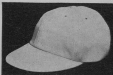
FOREST HILLS . . . No. 395

Sanforized gabardine, felt sweatband. Made in white or tan. White cap has green lining under visor. Small, medium, large and extra large sizes. . . . Retail 65c