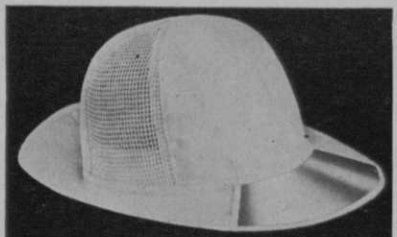
CONGO . . . No. 1200

New 1943 model in fine white or tan duck with airstream ventilators and transparent green pyralin eyeshade. Small, medium, large and extra large sizes. . . . Retail 65c