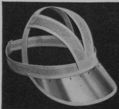
VICTORY . . . No. 580

Sanforized gabardine, felt sweatband. Made in white or tan. White cap has green lining under visor. Small, medium, large and extra large sizes. . . . Retail 65c