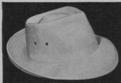
KING CONGO . . . No 2900

Smartly tailored in top quality light weight water repellent material. Steam blocked, flexible multi-stitched brim, made in light tan only. Sizes 6 \frac{7}{8} to 7 \frac{1}{2} . . . Retail $1.50