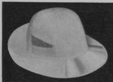
CONGO . . . No. 1300

Smartly tailored in top quality light weight water repellent material. Steam blocked, flexible multi-stitched brim, made in light tan only. Sizes 6 \frac{7}{8} to 7 \frac{1}{2} . . . Retail $1.50