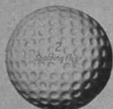
FLYER (Pro only)