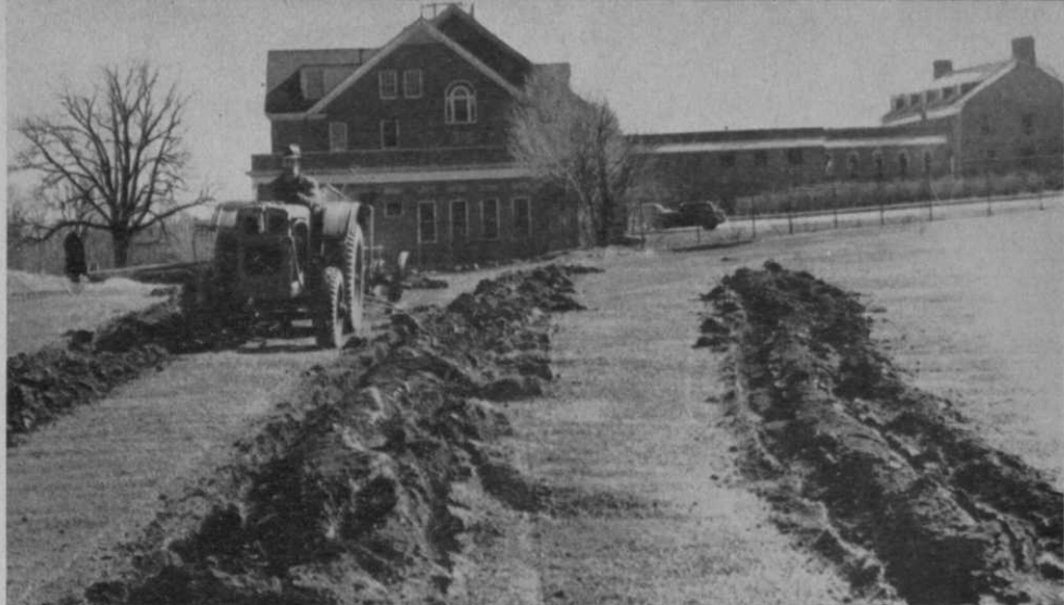
Tractor plowing six acres of property at Wykagyl CC (New Rochelle, N. Y.), for member V-gardens. By April 1, over 50 families had reserved plots, some as large as 10,000 sq. ft., under the strict requirement that all plots neglected by the members will be maintained by the club and the cost assessed against the members.

member. It results in a low cost for members who do not use the club very much and higher costs for those who play a lot of golf.