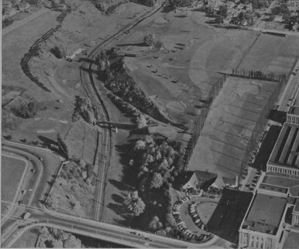
Aerial view of Lloyd's golf establishment, showing clubhouse and practice putting green in lower right, driving fairway straight out from clubhouse (flanked by 85 ft. fence) and the 9-hole short course shown center, left and top in photo.