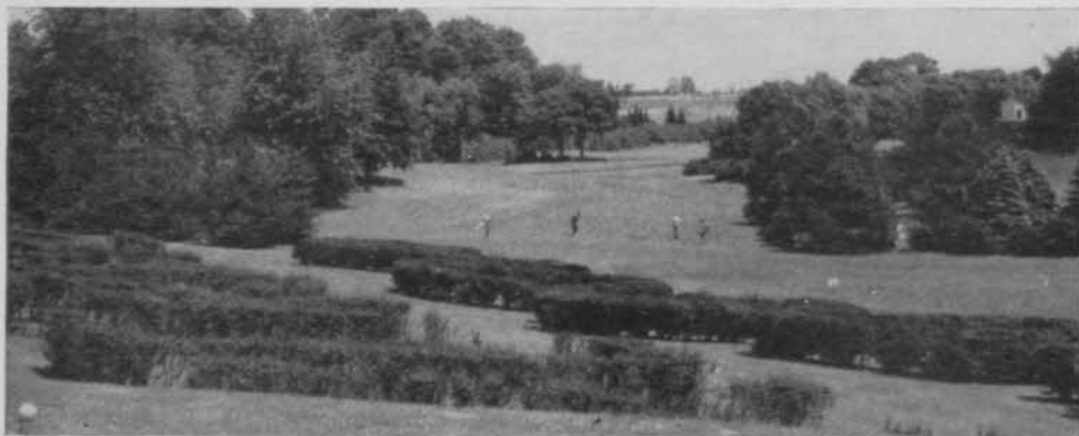
Hershey Country Club — Completely watered with Skinner System.