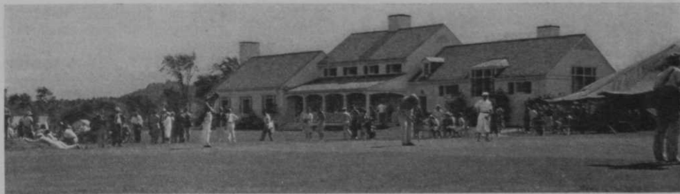
Recently completed clubhouse at Ekwanok preserves old time charm of original building, and at the same time, includes all proved modern features.