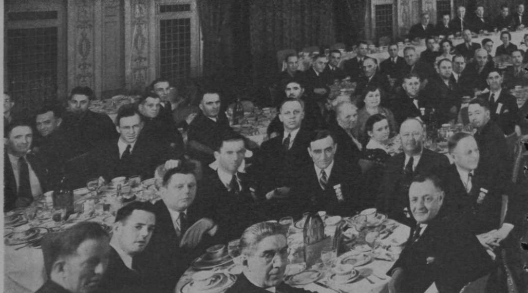
The great turn-out for this year's convention of the GSA