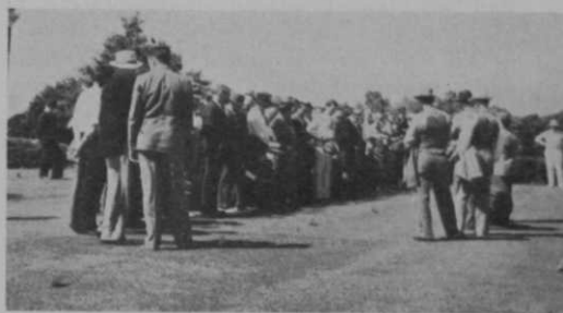
A highlight of the conference was the visit to the turf experimental plots at the N. J. Agricultural Experiment Station.