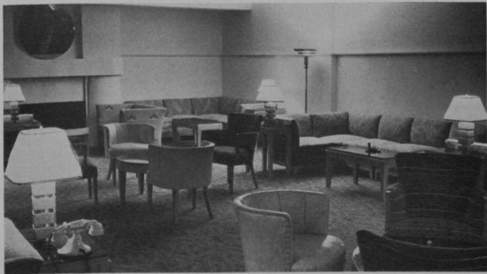
Plenty of light, smart grouping of furniture, and a swell job of interior decorating by Mrs. C. R. Bangs, make this women's lounge a most popular meeting place at Oak Park CC.

Selection of furniture and colors was particularly happy in brightening the room and providing several intimate groupings. Rose, a powder blue, beige and yellow are the colors used in the room. The job of interior decoration has been