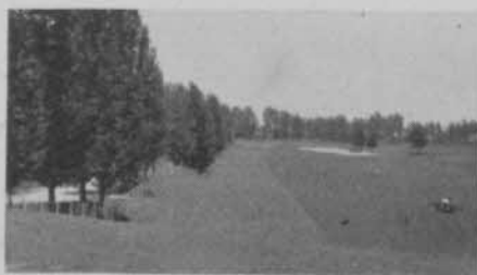
Course is nicely rolling, not flat.

Proof that the free group lessons which were given earlier by the City, and the promotion of this free exhibition match in opening the course, were good business, was borne out by the fact that play for the first fifteen days in spite of ten days of intermittent rain, at greens fees of