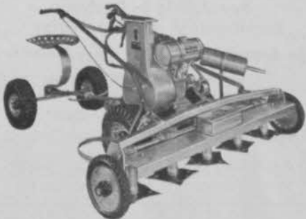
Standard Model C-8 with Trailer—Five Rotary Cutters —62 in. cut—Cap. 15 to 20 acres per day.

Fast, Powerful, Economical—that, plus the rotary cutting principle that has been developed into the most versatile cutting device in the field, is the reason why greenkeepers are swinging to Standard Mowing Equipment.