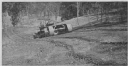
Tractors proved indispensable in grading and shaping both fairways and greens.

years, it is interesting to note that large equipment was used all the way in constructing Tilden golf course. Tractors were used from the day tree clearing began and continued to be used right down to the building of traps and shaping of greens. Horses and fresnos, which once were a