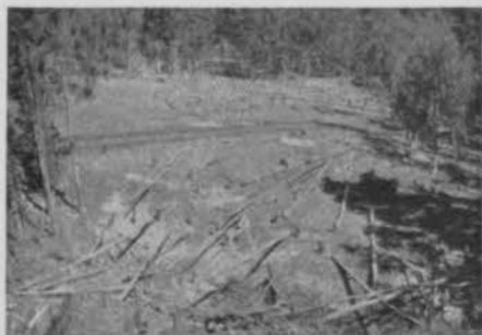
An idea of how much clearing was needed is given in this view of the practice fairway.

Indicative of how far golf course construction has advanced in the past few