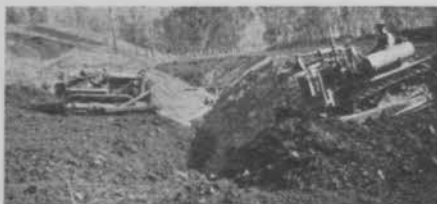
Tractors are seen here filling ditch before 13th and 18th greens.

A few construction facts are of interest. There were more than 30,000 trees, mainly eucalyptus, laurel and live oak, removed from the course areas. 40,000 cu. yds. of dirt was removed. The watering