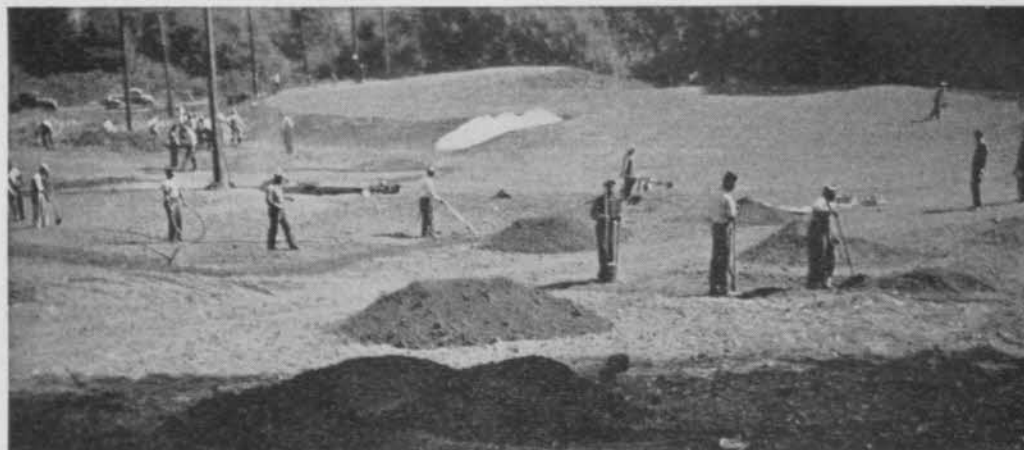
Construction view at Tilden Park. Workmen are seeding the 4th green in the background, while others nearer the camera are spreading topsoil for the fairway.