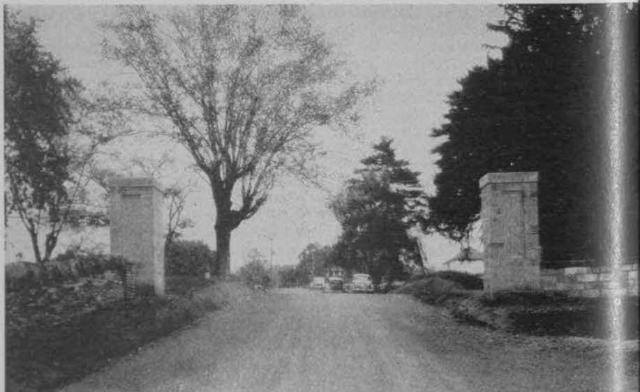
Since Bedford is the "Stone City," the attractive entrance pillars to Otis Park are appropriate of native limestone.

place. One look and he was satisfied. It would make a wonderful city park, and it would be something to leave to those old neighbors in "Dutchtown." Within three days the deal was completed and the city became the owner of a new park—Otis Park.