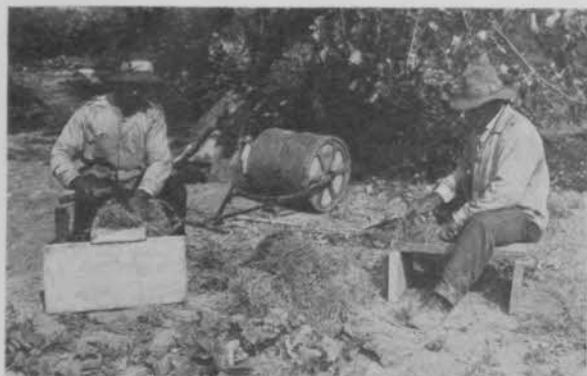
This photo records an important event in greenkeeping history. The time: 1918. The place: Potomac Park, D. C. The event: workmen preparing creeping bent stolons for application for the first time to a putting green.

baffled him so much that in 1910 he sought aid from scientists of the U. S. Dept. of Agriculture. This is believed to be the first case where the help of agricultural science was sought for golf course construction or maintenance.