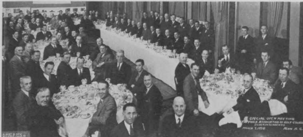
Philadelphia's turf interest is indicated by this fine turn-out for the local GCS dinner.