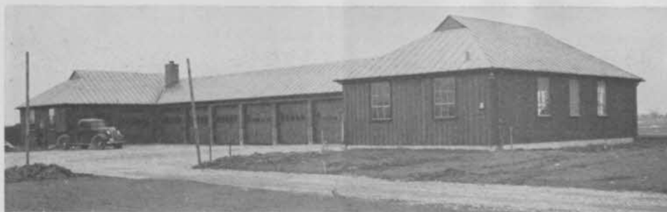
Attractive service barn at Ohio State is designed for efficient operation.

golf committee. Here is the comparison with Iowa, Stanford, Yale and Minnesota. Michigan, the other Midwestern university with golf accommodations comparable to Ohio, operates on a straight greens fee basis and does not provide similar locker-room and clubhouse facilities: