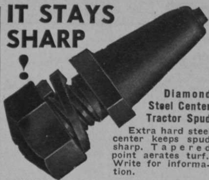
Diamond Steel Center Tractor Spud

Extra hard steel center keeps spud sharp. Tapered point aerates turf. Write for information.