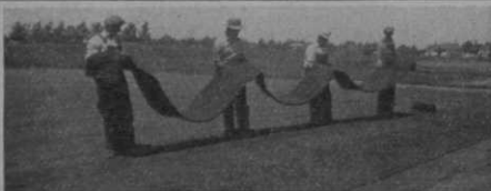
Showing a solid length of Bent turf to illustrate its toughness and strength, made possible only by proper preparation of soil.