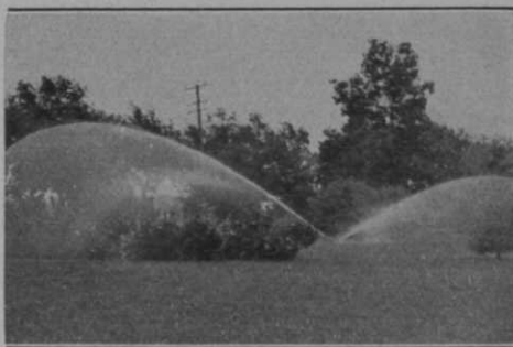
No. Y15—Perfection covering a 110 ft. circle on 35 lb. pressure, price only $12.50.

His reputation among the "trade," especially in the East, was extensive and to him goes the credit for introducing many items of greenkeeping equipment which found immediate acceptance among greenkeepers and are in universal use today.