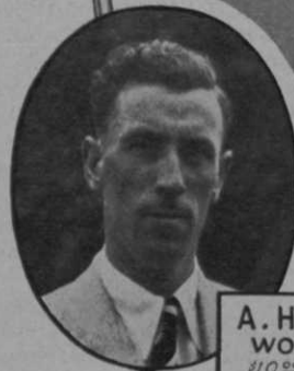
A. H. PADGHAM WOODS - IRONS

3 Registered Model Irons Retail Each $7.50 $6.00 $5.50