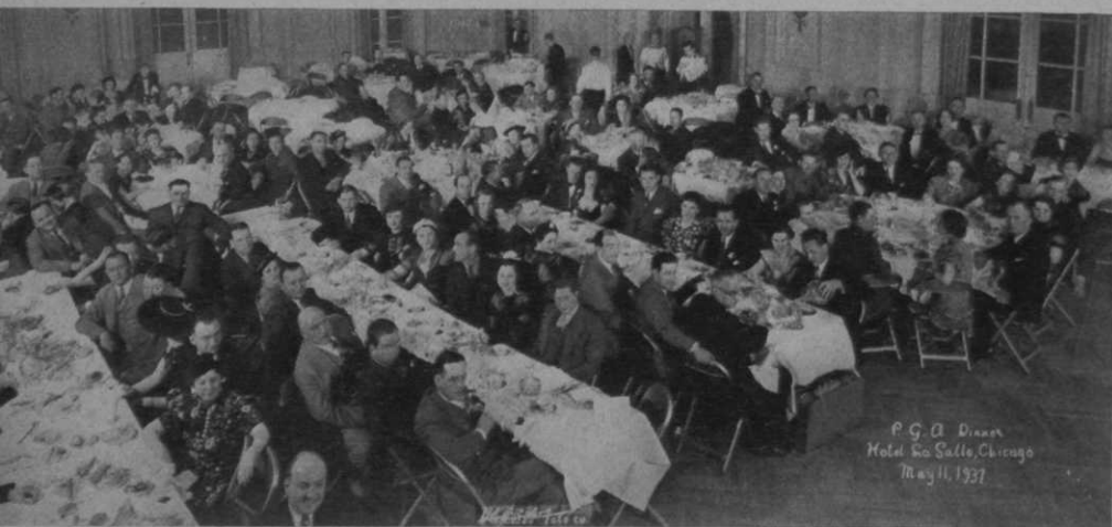
Illinois section of the PGA had this excellent turnout for their annual banquet held in Chicago on May 11. Approximately 150 attended.