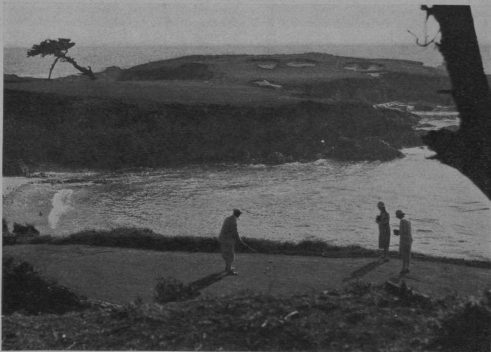
Of all courses in the United States, few exceed the links of Cypress Point at Del Monte, Calif., in picturesque architecture or exacting shot requirements. This sixteenth hole is typical of the problems that face the golfer almost constantly.

bitions, their objectives, their faults and virtues, their families, and the things that will inspire them to do their best for our interests, as well as their own. We must develop them with a capacity for initiative, self-reliance and self-direction so that they will work with the least cost of supervision. We should develop them to the point where they will be capable of answering the knock of opportunity when it presents itself. We must realize that a good greenkeeper cannot succeed except as his men succeed. The majority of men are satisfied to follow, rather than to lead, and I firmly believe that more is to be gained for the cause of individual recognition of the greenkeeper if we handle men as human beings, rather than as a mass machine. We must know how to have a sympathetic understanding of all their problems and how to reward and compensate them for work well done.