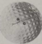
U. S. ROYAL NASSAU

Especially compressed for the light, accurate hitter