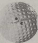
U. S. ROYAL ARROW

Especially compressed for the light, accurate hitter