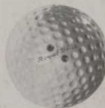
U. S. ROYAL BLUE

U. S. ROYALS are accurate . . . controllable . . . rugged . . . superior! Why? Just this: Into every U. S. Royal Golf Ball are built the engineering skill and knowledge of the chemistry of rubber gained in decades of plantation experiment . . . years of laboratory research . . . and in the manufacture of thousands of world-famous rubber products such as: U. S. Royal Master Tires • U. S. Waterproof Footwear • U. S. Royal Heels • Uskide • U. S. Drug Sundries • U. S. Mechanical Rubber Goods • U. S. Swim Suits, Caps, and Shoes • Keds • Kedettes • Gaytees