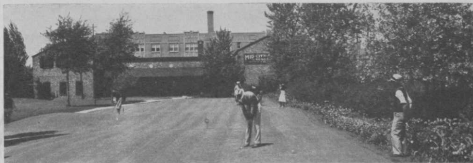
A practice green adds maintenance, but it also adds patronage at fee courses. The green shown here, 36 holes in length, prevents impatience when the first tee is crowded at the Mid-City (Chicago) course.

authority made several interesting references.