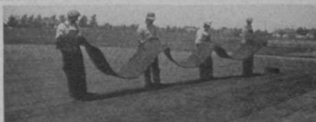
Showing a solid length of Bent turf to illustrate its toughness and strength, made possible only by proper preparation of soil.

Independent Protection Co., Inc. Dept A Goshen, Indiana