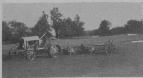
Twilight creeps onto the Country Club of Cleveland's second fairway, but speeding ahead of nightfall, and after the days play, rolls WORTHINGTON championship equipment, grooming the course perfectly for the next day's play.

When you can achieve this end with WORTHINGTON EQUIPMENT and save money in equipment costs—money that you desperately need for salary and other