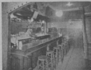
Locust Buffet—Before remodeling

This was the taproom so old and staid That meager profits seldom were made.