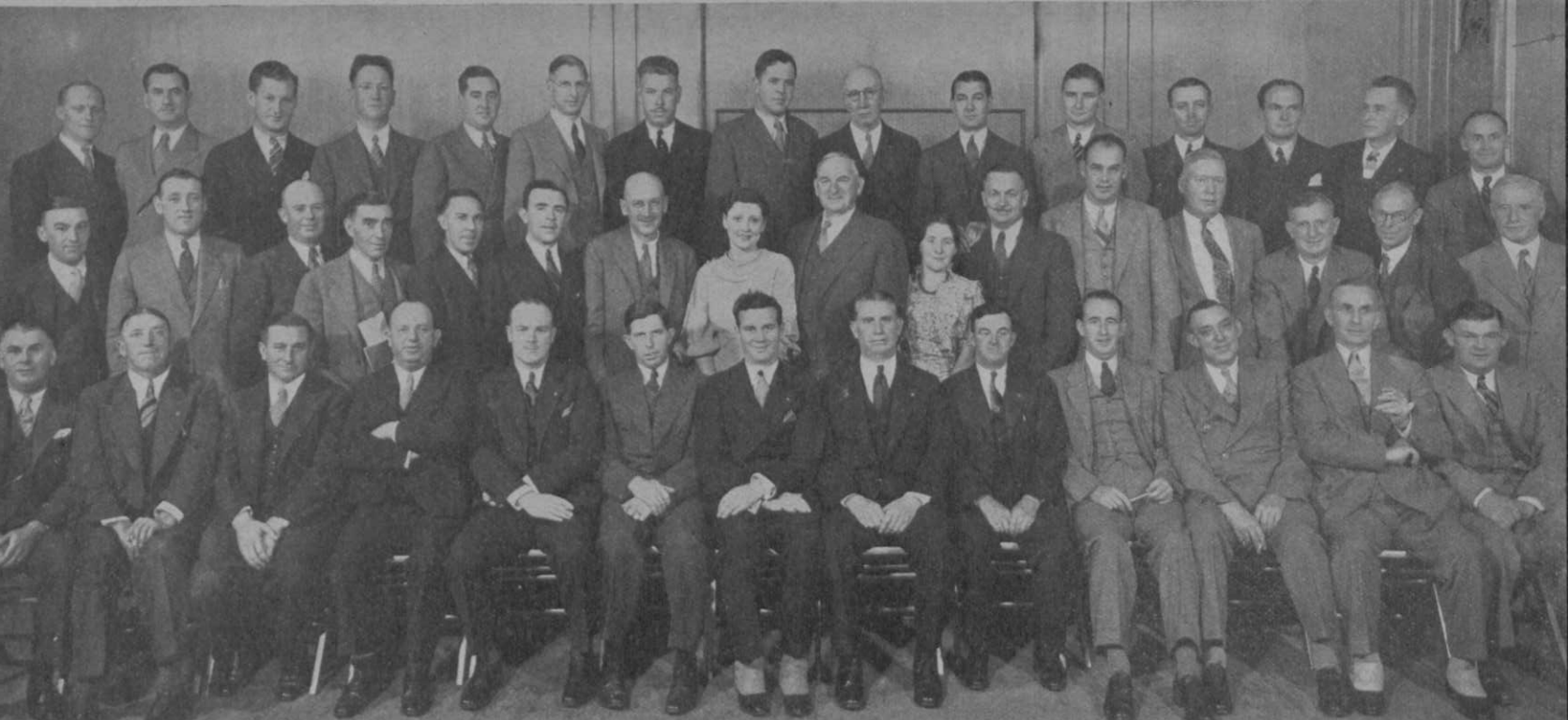
18th Annual Meeting Professional Golfers Association of America at the Morrison Hotel, Chicago, Ill. November 20th 1934