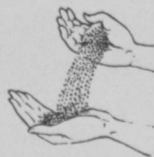
GRANULAR No Dust

Easy, safe to apply—even on windy days—Does not harden or cake in storage.