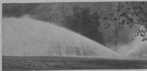
The Buckner Perfect "Curtain of Water"