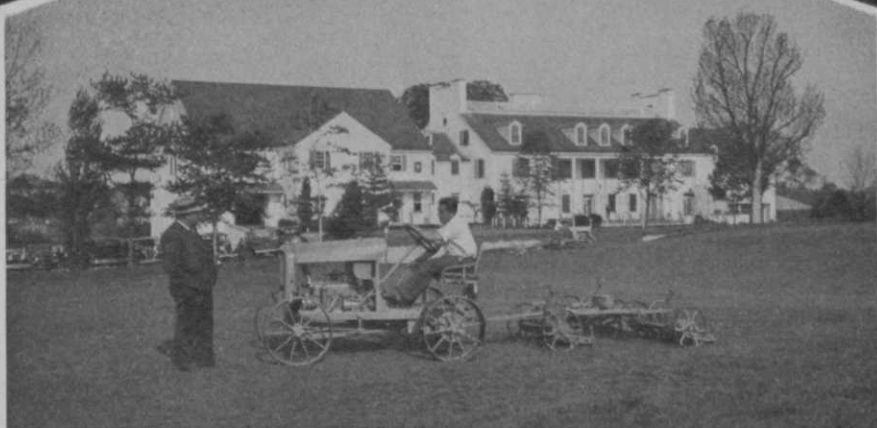
Merion Cricket Club, where the 1934 National Open was played, is equipped with two Worthington Tractors and Gang Mowers.