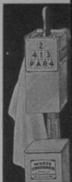
Showing Portion of Tee Ensemble

G. B. LEWIS COMPANY Dept. GD 934 Watertown, Wis.