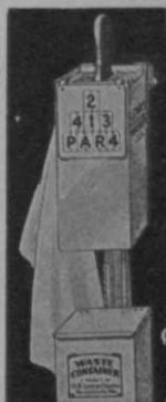
Showing Portion of Tee Ensemble

G. B. LEWIS COMPANY Dept. GD 834 Watertown, Wis.