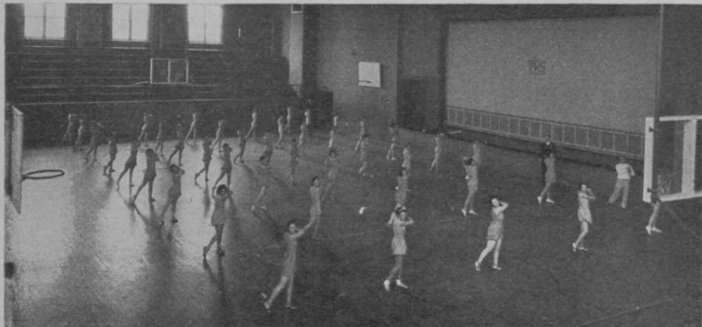
Everett Leonard teaches high school girl golf classes as part of their physical training study.